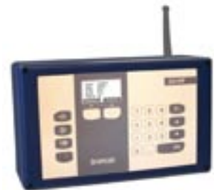
DU10P/WDL: - Looms without VDI interface - Knitting machines - Tufting machines