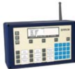
DU8P/WDL: - Knitting machines - Preparation machines - Tufting machines