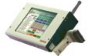
GTFI/WDL: - Inspection frames